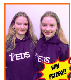
The new TEDS hoodies!

use some form of social media several times a day